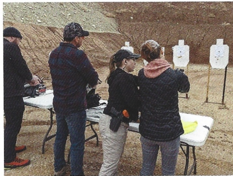
Basic Pistol Class